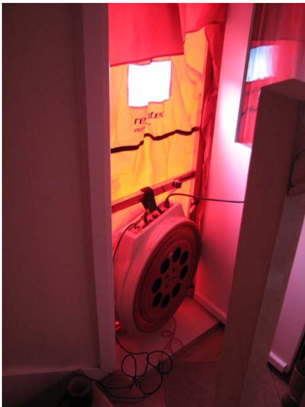
Blower fan to front door during airtest