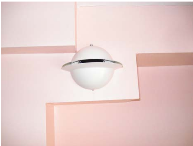
HRVU supply air diffuser