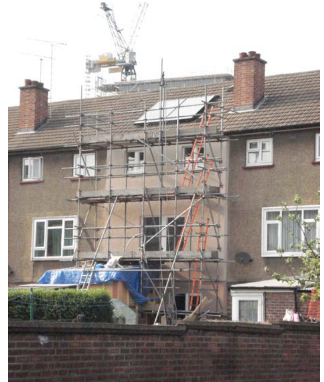
Solar thermal array installed and final render coat applied to external insulation