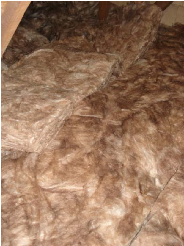
Mineral wool insulation in roof space