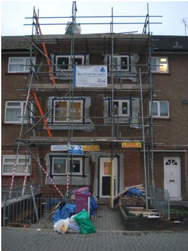
Installation of Passivhaus triple glazed windows