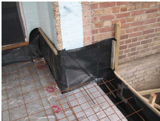
Creation of insulated foundations to new extension.