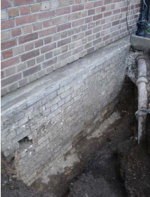
Creation of trench for below ground insulation, demolition of existing extension.