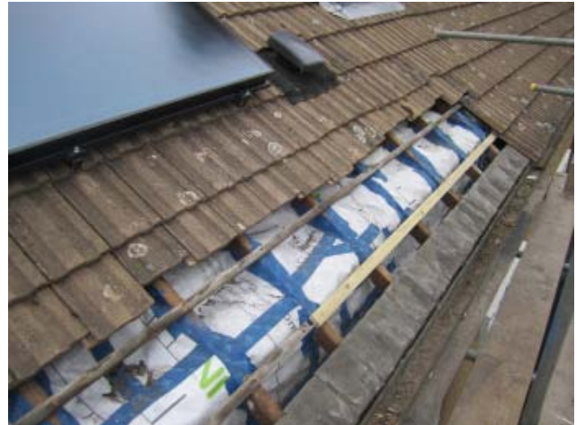
Achieving airtightness at eaves using airtightness tape and membranes