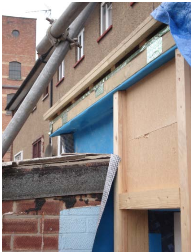
External wood fibre insulation