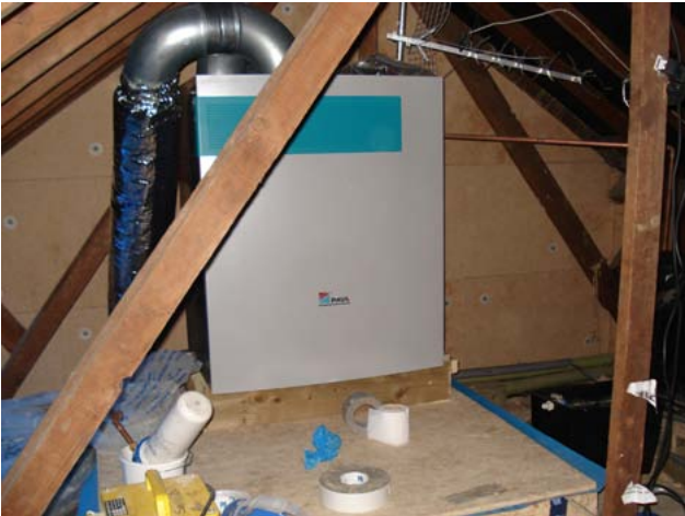
HRV unit installed in attic