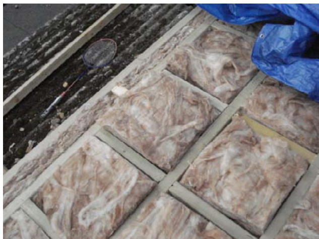
Mineral wool insulation in roof