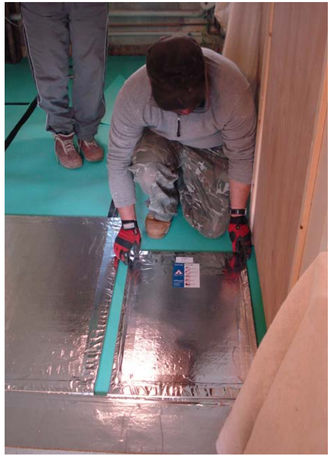
Vacuum insulation applied to ground floor slab