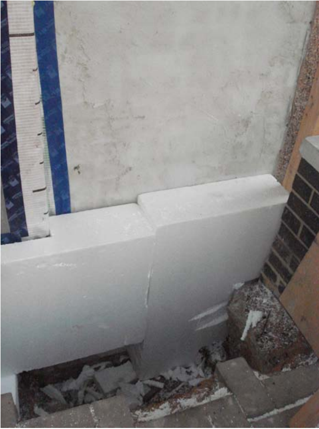
Application of parge coat and initial application of external insulation