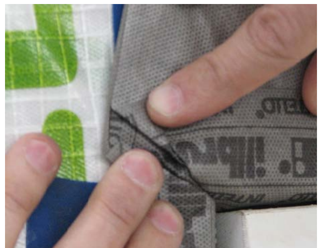
Correctly installed with "VRabbit ears"