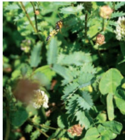
LEFT: Parasitic wasp anoplus viaticus ; BELOW: Bee bombus pascuorum